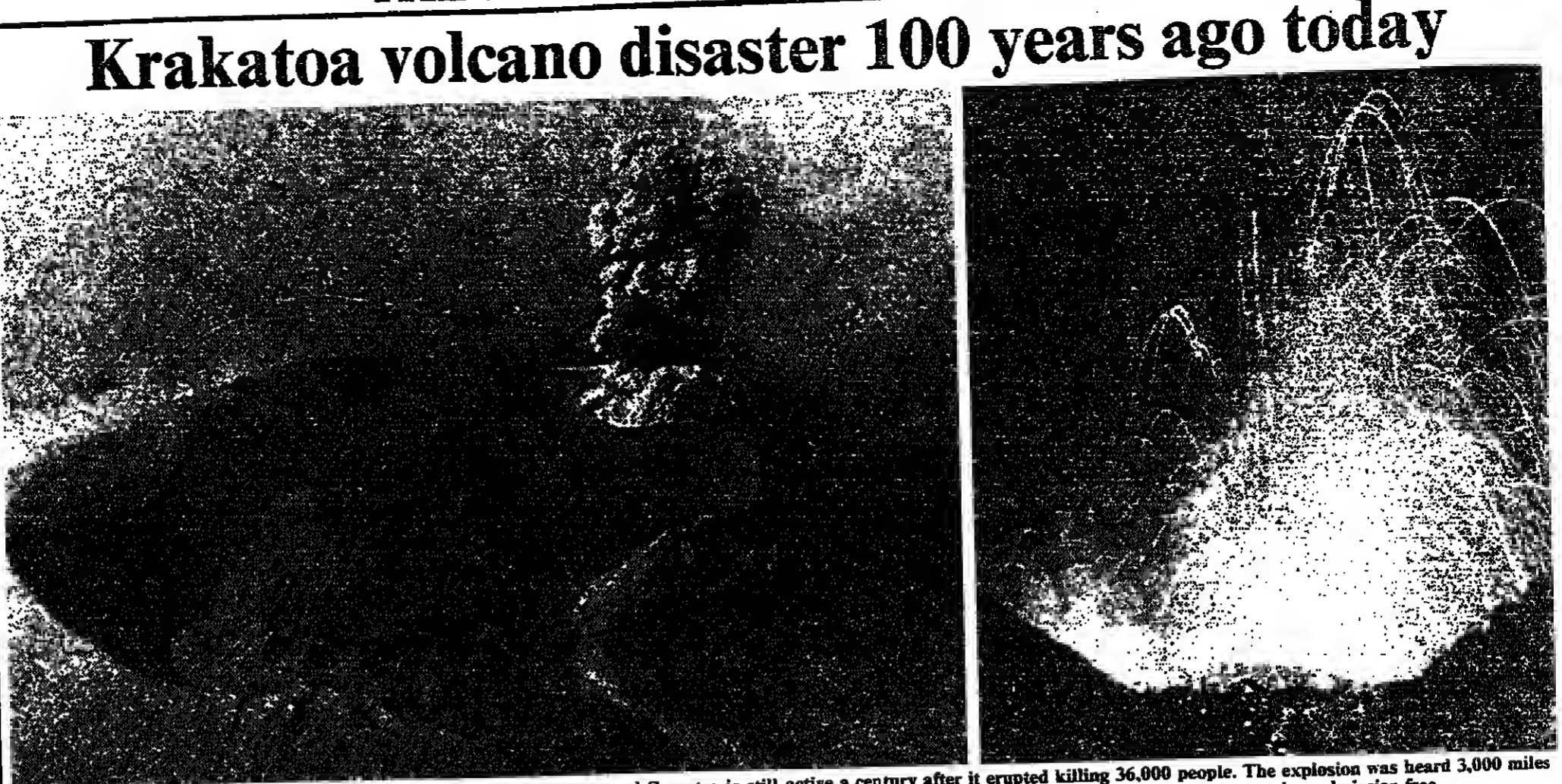
Spectacular present-day photographs show the volcano between Java and Sumatra is still active a century after it erupted killing 36,000 people. The explosion was heard 3,000 miles away and meteorological effects could be seen in Britain.

Continued from page 1 opposition because it was the other party to beat. I thought she was trying to cling to Labour because she was sure she could always beat them.